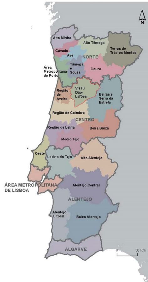
Figure 3: Localization of Viseu Dão lafões Region in Portugal, Source: INE (2015).

However, the territory shows great potential in terms of: (i) edaphoclimatic conditions that allow the production of a wide variety of agricultural products that may turn into an important source of income; and (ii) endogenous and traditional food products (DRAPC 2015). Agriculture is an important activity in the region, from both economic and social perspectives (Pato 2012). Here, many traditional agrifood products (e.g. 'vinho do Dão,' 'maçã Bravo de Esmolfe,' etc.) represent important factors of